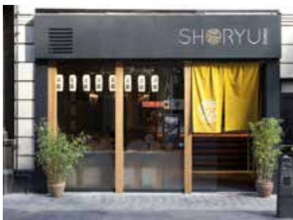
SHORYU RAMEN RESTAURANT CHAIN

G&T's core capabilities are Cost Management and Project Management, which accounted for 81% of Group turnover in 14/15. Our remaining income came from our range of complementary specialist services.