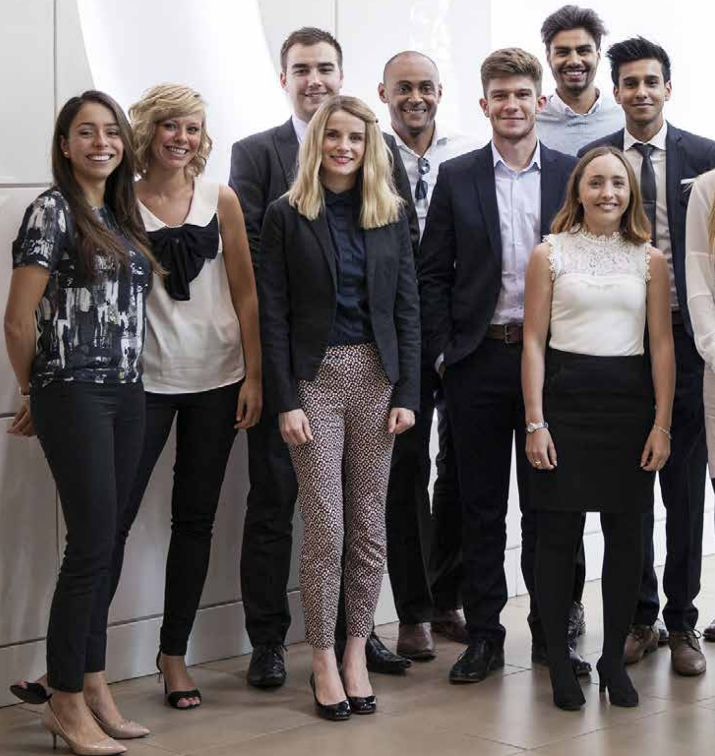
SOME OF THE 2015 GRADUATE COHORT

“In 14/15 G&T continued to support and nurture new talent within the firm. We welcomed 31 young people onto our graduate scheme , bringing the total number of graduates in the firm to 118. We also welcomed 13 trainees, reflecting the rise in apprenticeships as a route to qualification which is helping to open up the industry to a diverse new pool of talent. And we offered work experience programmes to 36 school and college students, with the aim of igniting their interest in a career within the property and construction sector.”