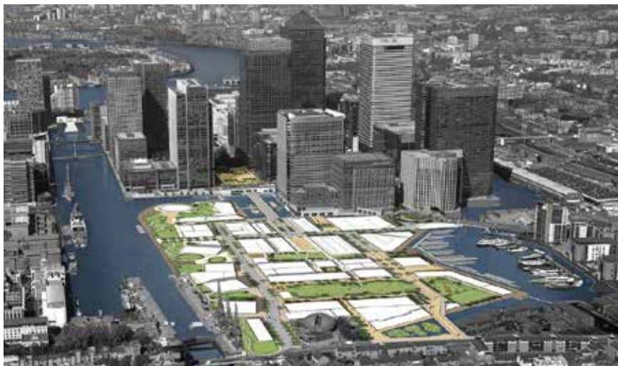
CANARY WHARF GROUP'S WOOD WHARF

During 14/15 our FM Consultancy Team was appointed by Transport for London to provide specialist support to their Pan TfL FM project