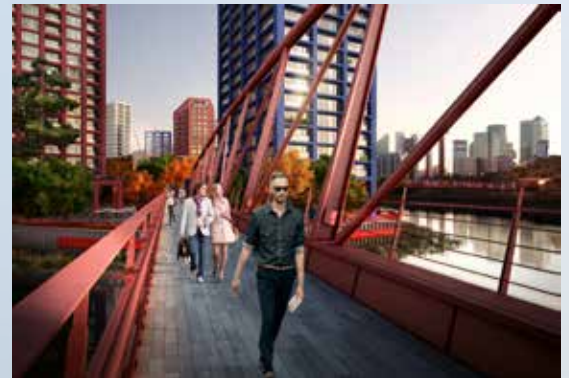
Front outside cover

development of nine residential blocks on an island site in the River Lea opposite the O2 Arena. This is part of a sustainable mixed-use development containing an arts centre and gallery, together with shops, restaurants and cafés which will help to give London City Island the feel of an authentic and creative riverside community.