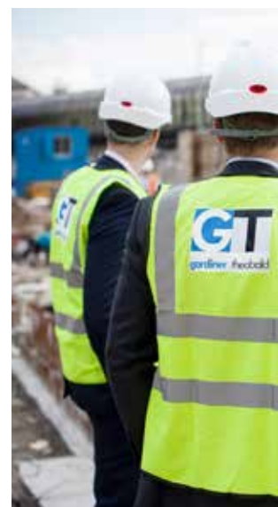
CLOCKWISE FROM TOP: