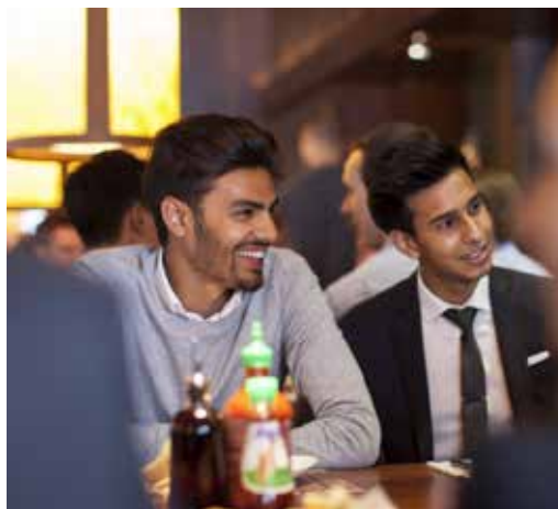
2015 GRADUATE INDUCTION DAY

This very sharp increase in profit was earned against a more modest +19% increase in Group turnover. This reflects the re-focussing of our business model towards the UK, US and selected international markets whilst continuing our strategy of transferring ownership of some non-UK businesses back to the local management teams. The impact of this has been to reduce our overseas turnover by -3% while simultaneously increasing our UK turnover by +26%.