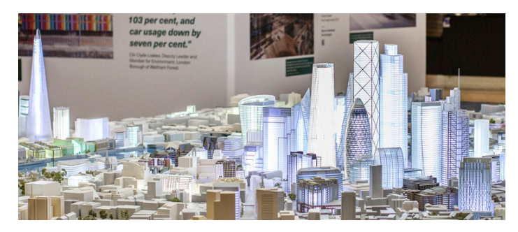
We continued to offer Apprenticeships